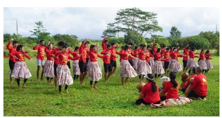
Beautiful ho'okupu of hula a me mele allowed each haumāna to share aloha . Overcast skies were brightened by their presence.