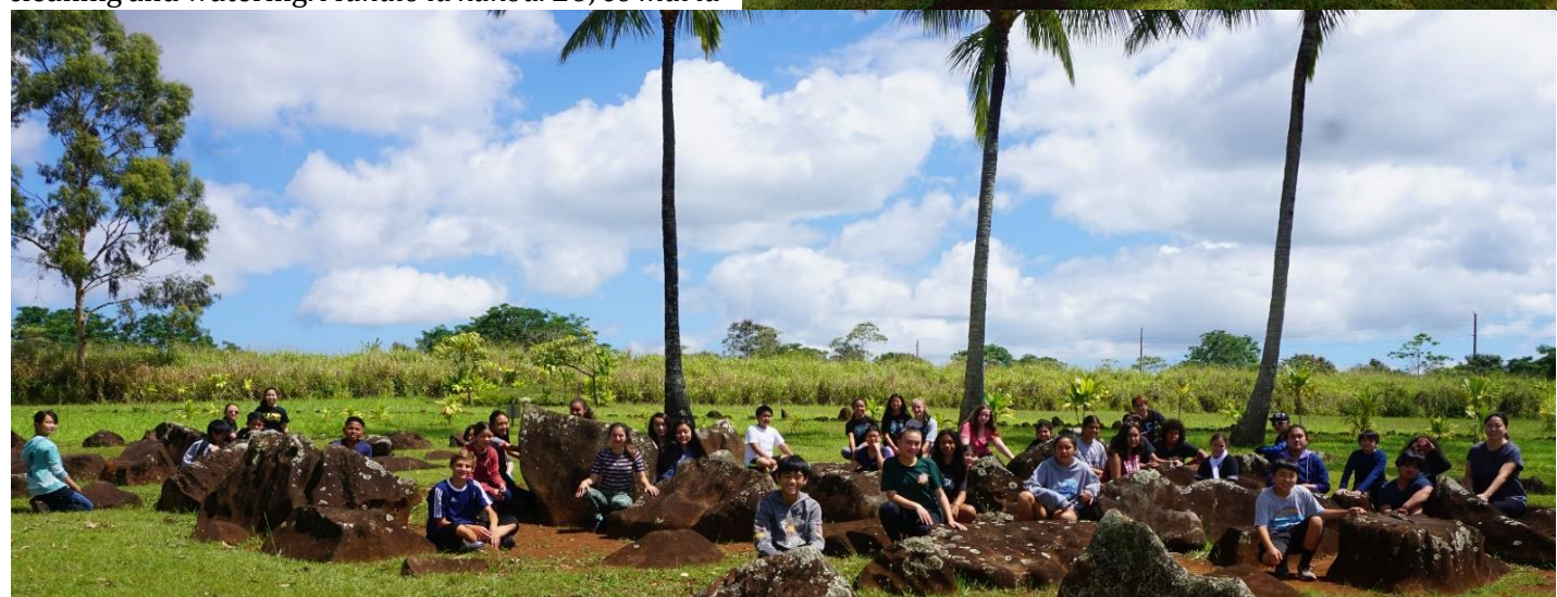
Mahalo haumāna of Mililani Middle for your assist to malama and sharing our Kūkaniloko Piko Listening Journey with Kahuiao.